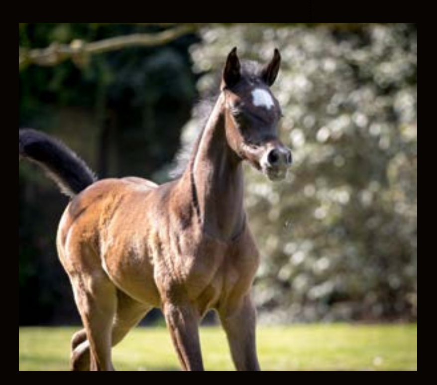
FILIA J (SHIRAZ DE LAFON X FLIRTATION J) 2019 GREY FILLY