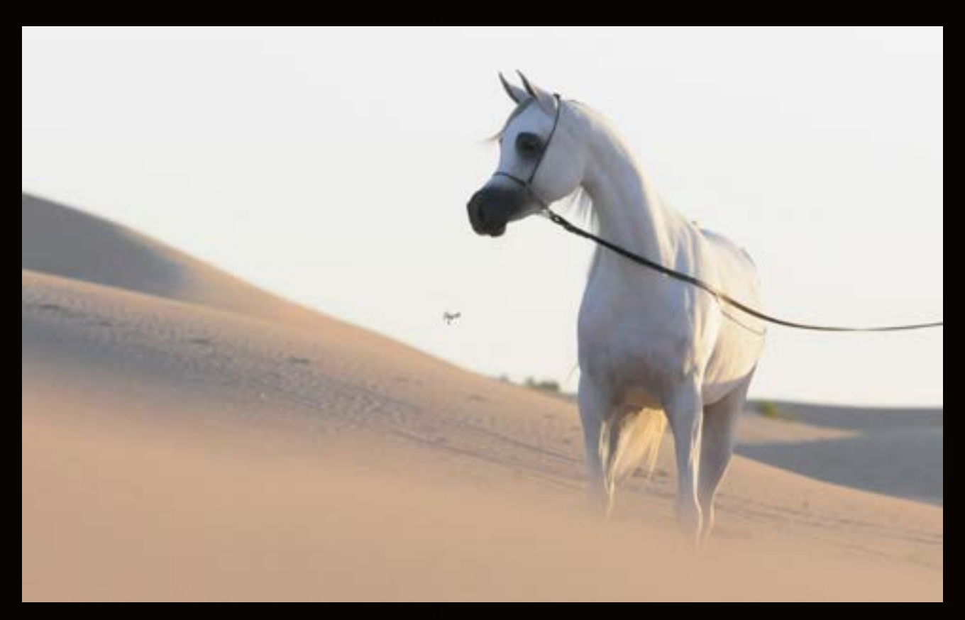
AV PURPLE RAIN (SHIRAZ DE LAFON X AV DANCING RAINA) 2017 GREY FILLY