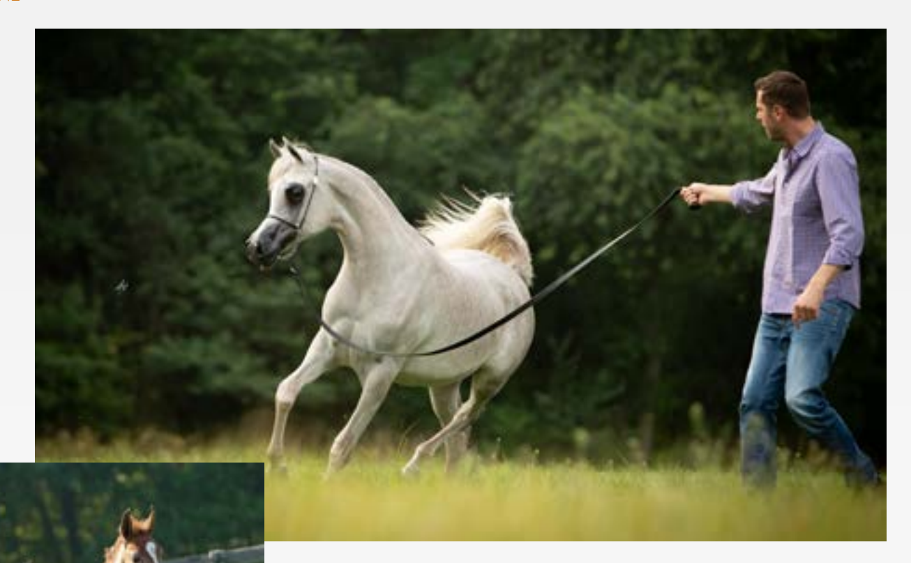
MESSOUDA J (SHIRAZ DE LAFON X MIAMI J) 2018 GREY FILLY