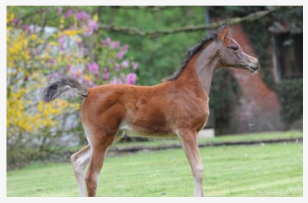
RANIA JK (SHIRAZ DE LAFON X RAYYANA K) 2016 BAY MARE