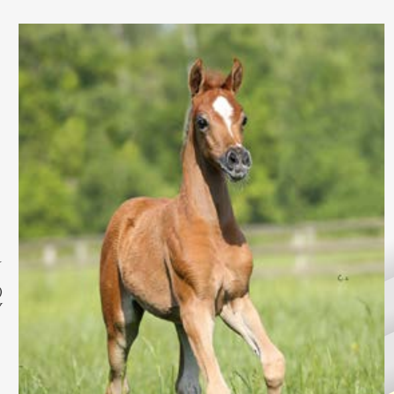
KARIMA J (SHIRAZ DE LAFON X MARRAKECH J) 2018 GREY FILLY