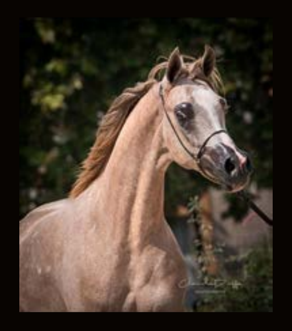
PÉGAZE J COUPE DE FRANCE 2019