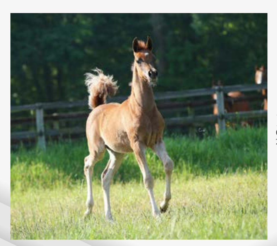
FORMOSA J (SHIRAZ DE LAFON X FLIRTATION J) 2018 CHESTNUT FILLY