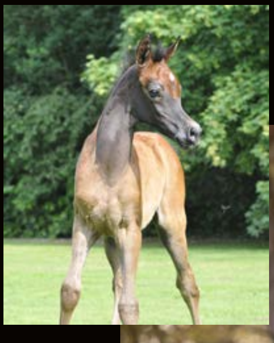
MONTANA J (SHIRAZ DE LAFON X MELODY J) 2018 GREY FILLY