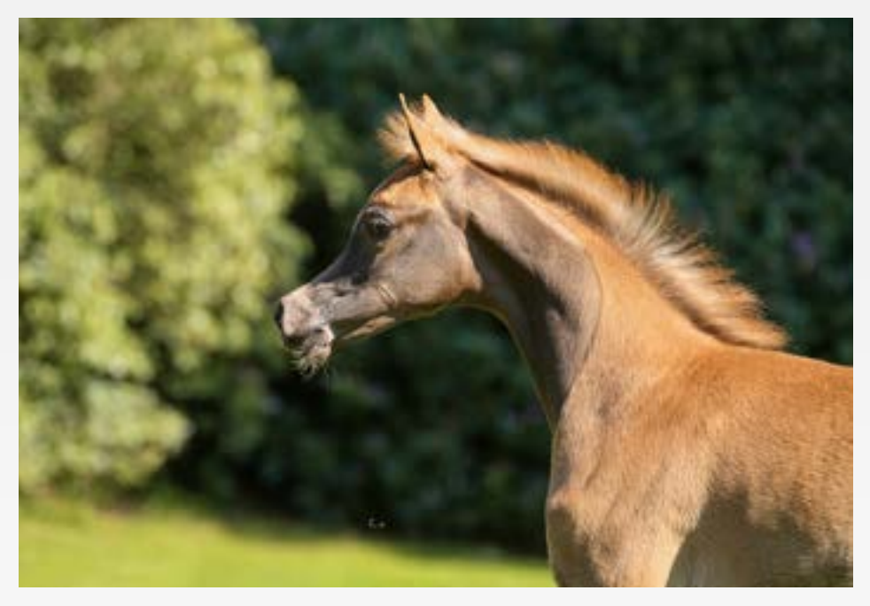
ASAYEL DREAM J (SHIRAZ DE LAFON X MAGNIFICENT LADY J) 2018 CHESTNUT FILLY