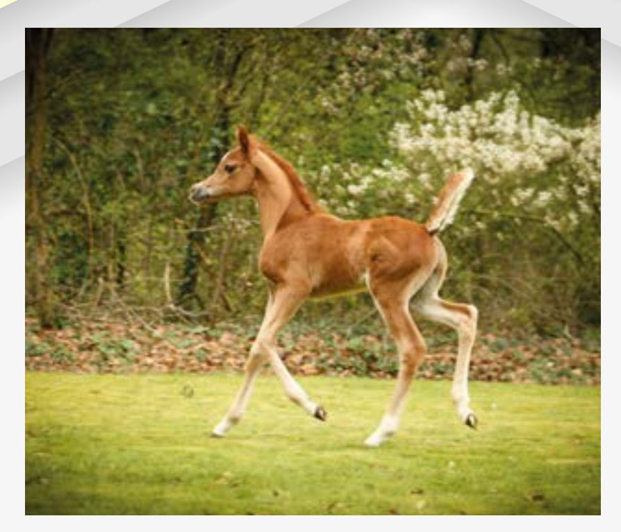
MALIK J (SHIRAZ DE LAFON X MIAMI J) 2020 CHESTNUT COLT

MAYSA J (SHIRAZ DE LAFON X MIAMI J) 2020 GREY FILLY